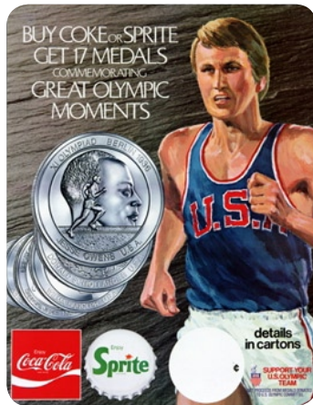
Coca-Cola has a long tradition of support for Olympic athletes around the world.