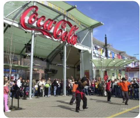
We provided fan fun with a Rocky Mountain flare at Salt Lake 2002.

Coca-Cola marked the 10th anniversary of our first association with the Olympic Torch Relay by serving as co-presenter and selecting more than 3,500 of the total 11,500 torchbearers for the 65-day, 13,500-mile (21,726-kilometer) spectacle that blazed through 46 American states. We again brought consumers from other nations (nine countries for 2002) to be torchbearers in the host country of the Games. More than 2,100 support runners also were provided through our efforts, and unveilings of "Coca-Cola Community Canvas" teen artworks highlighted local celebrations in cities welcoming the Olympic Flame. In addition, we commissioned world-renowned artist Peter Max to paint a giant mural mosaic commemorating the inspirational Community Canvas artworks and paying tribute to the spirit of the 2002 Olympic Winter Games. The Peter Max creation was donated to Salt Lake City.