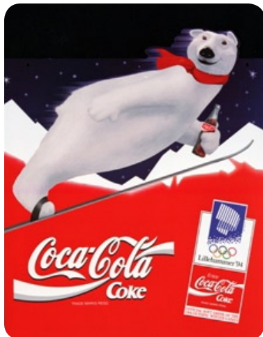
The lovable Coca-Cola Polar Bear made one of its first appearances at Lillehammer 1994.