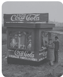
Our presence at the Olympic Games began in Amsterdam.

Here are some of the historical highlights and breakthrough programs from the enduring relationship between our Company and the Olympic Games.