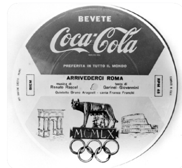
At Rome 1960, we helped produce a new "Olympic Games record."

During the 1960 Olympic Games in Rome, Italian bottlers of Coca-Cola showed their support by presenting thousands of athletes, officials, media and spectators with an original, 45-rpm recording of the favorite song of the day, "Arrivederci Roma."