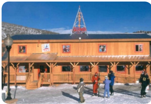
Coca-Cola Radio deejays broadcast the experience of the Games from our Park City studios.

During the 2002 Games in Utah, more than 700,000 people connected with our interactive and entertainment experiences in Salt Lake City and Park City. As at past events, crowds typically swelled at the ever-popular Coca-Cola Official Olympic Pin Trading Centers (which numbered three for Salt Lake 2002), while a new attraction, Coca-Cola On The Ice , became the fan focal point outside competition venues. The 20,000-square-foot On The Ice facility featured high-tech, winter sports simulations and plenty of crowd action, so guests could experience first-hand the thrill of the luge, bobsleigh, hockey and curling, as well as the emotion of receiving a medal on the victory stand. "Coca-Cola Live" multimedia shows and interviews with Olympic legends enhanced entertainment for Pin Trading Center visitors. Our multicultural pin trading staff, along with a group of special "Coca-Cola Ambassadors," hailed from five continents and spoke some 20 languages, providing an extra-warm reception and helping unite people from around the globe.