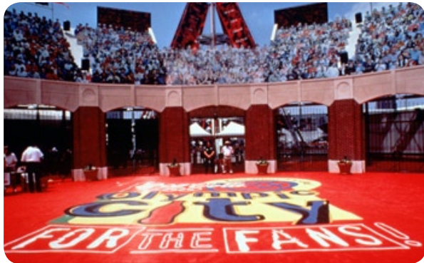
"Coca-Cola Olympic City" was a central, interactive theme park for fans at Atlanta 1996.