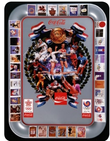
This commemorative 1988 Coca-Cola serving tray honored the athletes and history of the Olympic Games.

We broke new ground in 1988 by creating the "Coca-Cola World Chorus," which performed at the Opening and Closing Ceremonies of the Olympic Winter Games in Canada. Comprised of 43 young people selected from 23 countries through competitions sponsored by local Coca-Cola bottlers, our international chorus performed the specially commissioned signature song of the Games, "Can't You Feel It?" for the local throngs and millions of television viewers. Calgary 1988 also saw the debut of the first Coca-Cola Official Olympic Pin Trading Center, which drew more than 17,000 visitors each day and transformed pin trading into another tradition – "the No. 1 spectator sport of the Olympic Games."