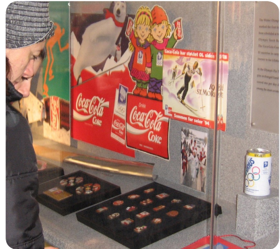
Artifacts of the historical partnership between Coca-Cola and the Olympic Games on display at Torino 2006.

During Torino 2006, our fully integrated campaign included customized advertising and outdoor messages; a specially created anthem; and (in Torino’s Piazza Solferino) the Coca-Cola Official Olympic Pin Trading Center, historical exhibits, and several entertainment elements, such as sports simulators, video game and photo kiosks, and a postcard email booth. Mobile “Coca-Cola Cruisers” provided spectators free commemorative beverage products, while the Coca-Cola Polar Bear and young Coca-Cola Ambassadors (drawn from more than 200 people from at least 20 countries who were part of a special Coke activation team) roamed the streets, instantaneously rewarding “random acts of kindness.” Each evening, “The Coca-Cola Award: Live Olympic” ceremony recognized individuals from around the world who express the ideals of the Olympic Games in their everyday lives. And our international “Torino Conversations” Weblog program brought standout, university-level journalism students from six countries to Torino to experience the Olympic Winter Games, conduct interviews and post their accounts online.