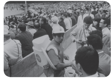
Our futuristic backpack dispensers were a big crowd pleaser at Mexico City 1968.

We outfitted our venue servers at the Mexico City 1968 Olympic Games with special backpack dispensers, prompting some spectators to call them “astronauts.” Meanwhile, Olympic Games-themed television commercials, including a Coca-Cola TV spot starring 1960 swimming gold medalist Lynn Burke, brought the Games experience into the homes of millions of viewers.