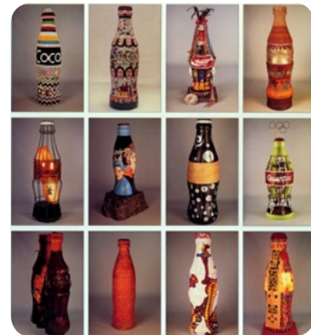
More than 50 countries were represented in our Coca-Cola Olympic Salute to Folk Art Exhibit at the Atlanta 1996 Centennial Olympic Games.

The Pin Trading Centers experienced unprecedented traffic levels, with an estimated 3 million pins changing hands, and hosted lighthearted Pin Trading School sessions, from which more than 2,100 "students" earned their MPA ("Master of Pin Administration") degrees. Pin popularity was further bolstered by our support of the official 1996 Olympic Games Pin Society.