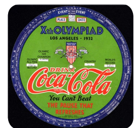
This 1932 record keeper is now a rare collectible from the Olympic Games.

For the Los Angeles 1932 Olympic Games, we broadened the stadium experience by introducing an Olympic Games personal record keeper, compliments of The Coca-Cola Bottling Company of Los Angeles.