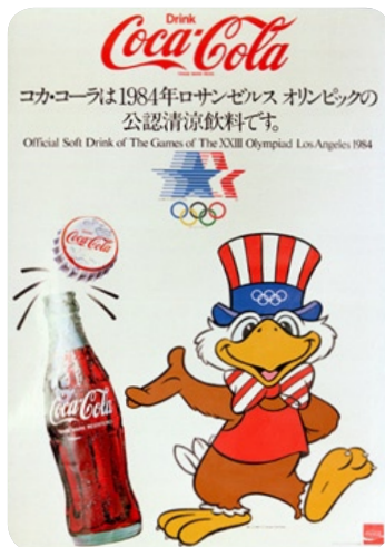
Coca-Cola and mascot Sam the Eagle welcomed the world to Los Angeles 1984.

More than 1.1 million Coca-Cola cans were produced in the Netherlands and Germany, filled in Austria, and shipped to Yugoslavia for the Sarajevo 1984 Olympic Winter Games.