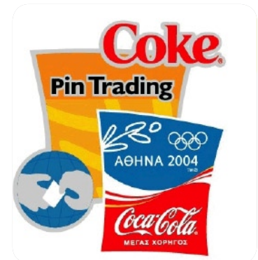
Our Olympic Pin Trading Centers have been a fixture at the Olympic Games since 1988.

For the first truly worldwide Olympic Torch Relay – a symbol of unity and inspiration – the Olympic Flame traveled internationally to more than 30 cities on the five continents represented by the Olympic Rings. The Flame then returned to Greece, the birthplace of the Olympic Games, for a final, five-week segment of the Olympic Torch Relay that culminated with the lighting of the Olympic Cauldron at the Opening Ceremony of the Athens 2004 Olympic Games. Coca-Cola selected many of the more-than 11,000 torchbearers who helped carry the Olympic Flame on its historic, round-the-world journey. The theme for the Athens 2004 Olympic Torch Relay was, “Pass the flame, unite the world.”