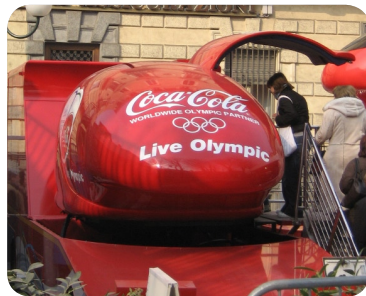
This ski simulator gave Torino fans a taste of the winter sports competition.

Along with chances to receive Torino 2006 Coca-Cola collectibles and win trips to the event in Italy, consumers in other countries were drawn into the spirit through a variety of local programs, including unique opportunities in Canada to win trips to other cities that have hosted (or will host) the Olympic Winter Games; an Internet-based “Win Your Olympic Dream” promotion in Austria; a multifaceted “Win Winter Fun” program in Switzerland; a fund-raising drive for the Swedish Youth Olympic Team; a “virtual cheers” mobile phone contest in Belarus and Russia; GEORGIA® coffee “Cheer-on Cans” starring Olympic heroes in Japan; and a major “Drink. Watch. Cheer. Win.” promotion in the United States.